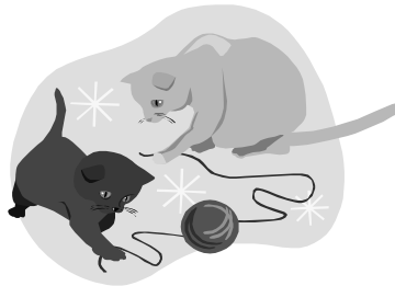
“Autumn” and “Keiko”

...that two kitties are in need of a good home? They are 1-year-old shorthair female litter-mates, spayed and declawed with all vaccines and flea treatments, raised in a household with children. The family has moved back to Japan ~ the cats are the pets of a missionary family who were on home assignment. More details are posted on the kiosk. Contact Deb Shold.